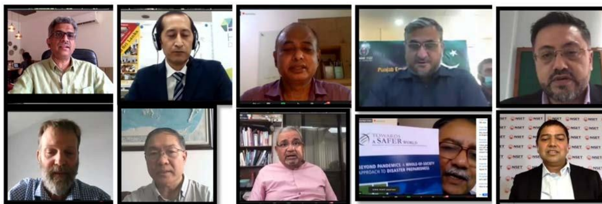
Glimpse of Webinar:

The brief report of Webinar proceedings is available here . ■