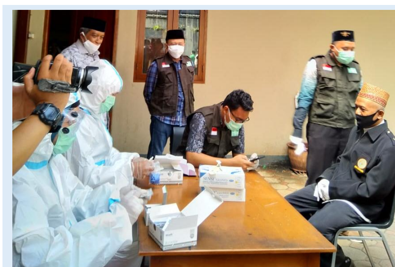
Rapid Test LPBINU, SEJAR, Jakarta, Indonesia.

From here was born the SEJAR Network (Sekretariat Jaringan-antar-Jaringan OMS-LSM in Bahasa Indonesia) – a network of networks that aims to promote the active role of civil society in the public discourse around COVID-19. SEJAR, at the Secretariat level, is a collaboration