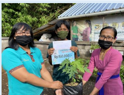
Educational Caricature Competition of COVID-19 Prevention, SEJAJAR, MBM Foundation, Bali.