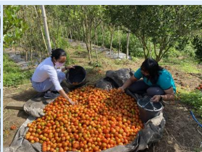
Marketing the agricultural production, SEJAJAR, MBM Foundation, Bali.