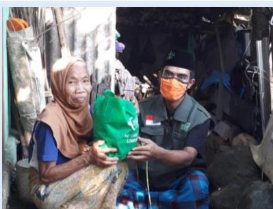
Distribution of groceries to people affected by COVID-19, SEJAJAR, West Lombok, LPBINU, Bali.

The Institute for Disaster Management and Climate Change of Nahdlatul Ulama (LPBI NU) conducts disinfectant spraying activities in mosques and temples, distribution of groceries to COVID-19 affected groups, and the provision of rapid test facilities.