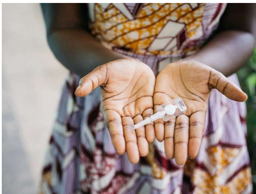
DMPA-SC self-injectable contraceptive – Photo reproduced from the PATH website at www.path.org